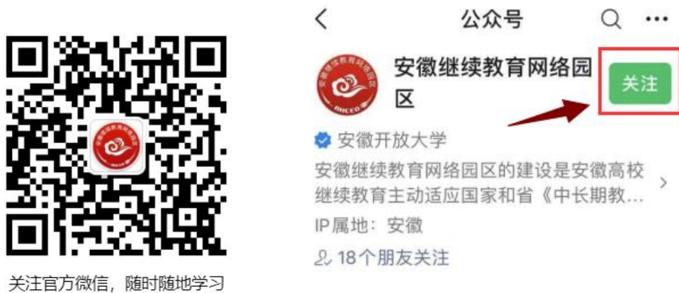
图 5 “安徽继续网络园区”公众号二维码