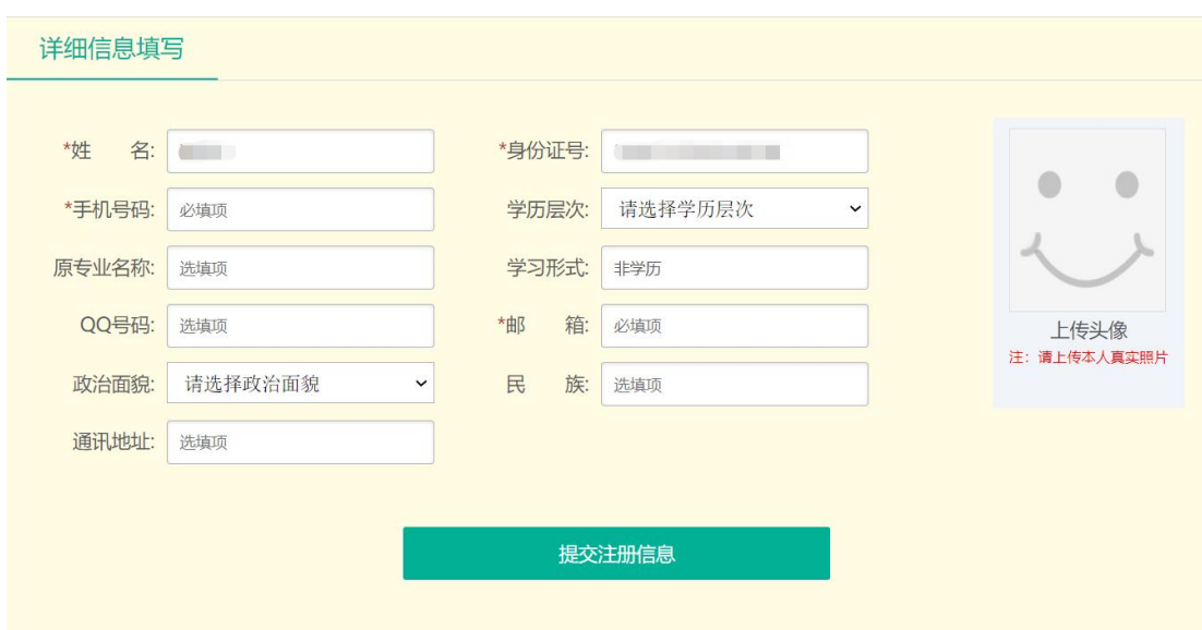
图 3 填写注册信息

进入下一步，填写手机号码及邮箱，上传个人证件照后，提交注册信息即可注册成功。注册信息填写界面如图 3 所示：