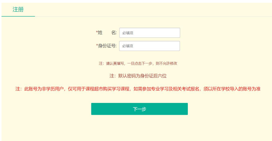
图 2 注册页面

进入下一步，填写手机号码及邮箱，上传个人证件照后，提交注册信息即可注册成功。注册信息填写界面如图 3 所示：